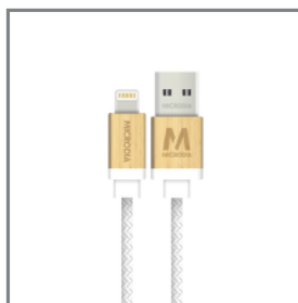
Cable de Cuir Bamboo Wood

MFi-Certified High Speed Luxurious Lightning™ Cable Covered by Genuine Calf Leather and a Natural Wood Connector