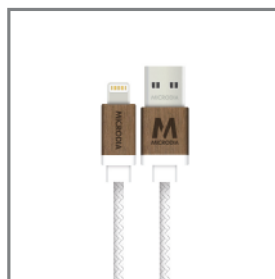
Cable de Cuir Maple Wood