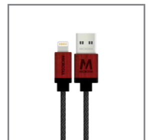
Cable de Cuir Rosewood