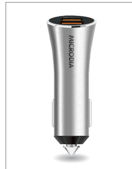
Car-Charger Plus QC3.0 USB + Dual USB-C Car-Charger