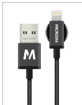
Charge Cable MFi-Certified Lightning Cable + Magnet Clip for Neat Cable Management