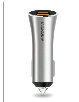
Car-Charger Plus QC3.0 USB + Dual USB-C Car-Charger