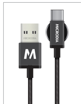
Charge Cable C USB-IF Certified USB TYPE-C Cable + Magnet Clip for Neat Cable Management