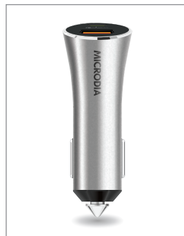
Car-Charger QC3.0 USB + USB-C Car-Charger